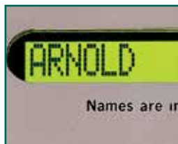
big characters half inch LCD display