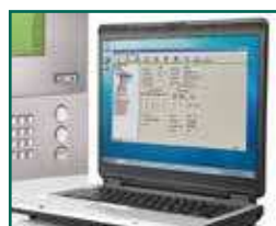
pc programmable easy to use software included