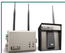
wireless expansion up to 24 entry points