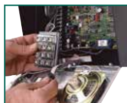
modular design makes installation and service easy