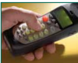
grant guest access by pressing 9 on the telephone