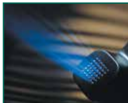
full duplex Hi quality communication – the same standard that the phone company uses