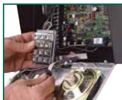
modular design makes installation and service easy