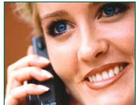
talk to front door or gate from any telephone in the home