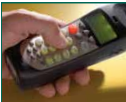
grant guest access by pressing 9 on the telephone