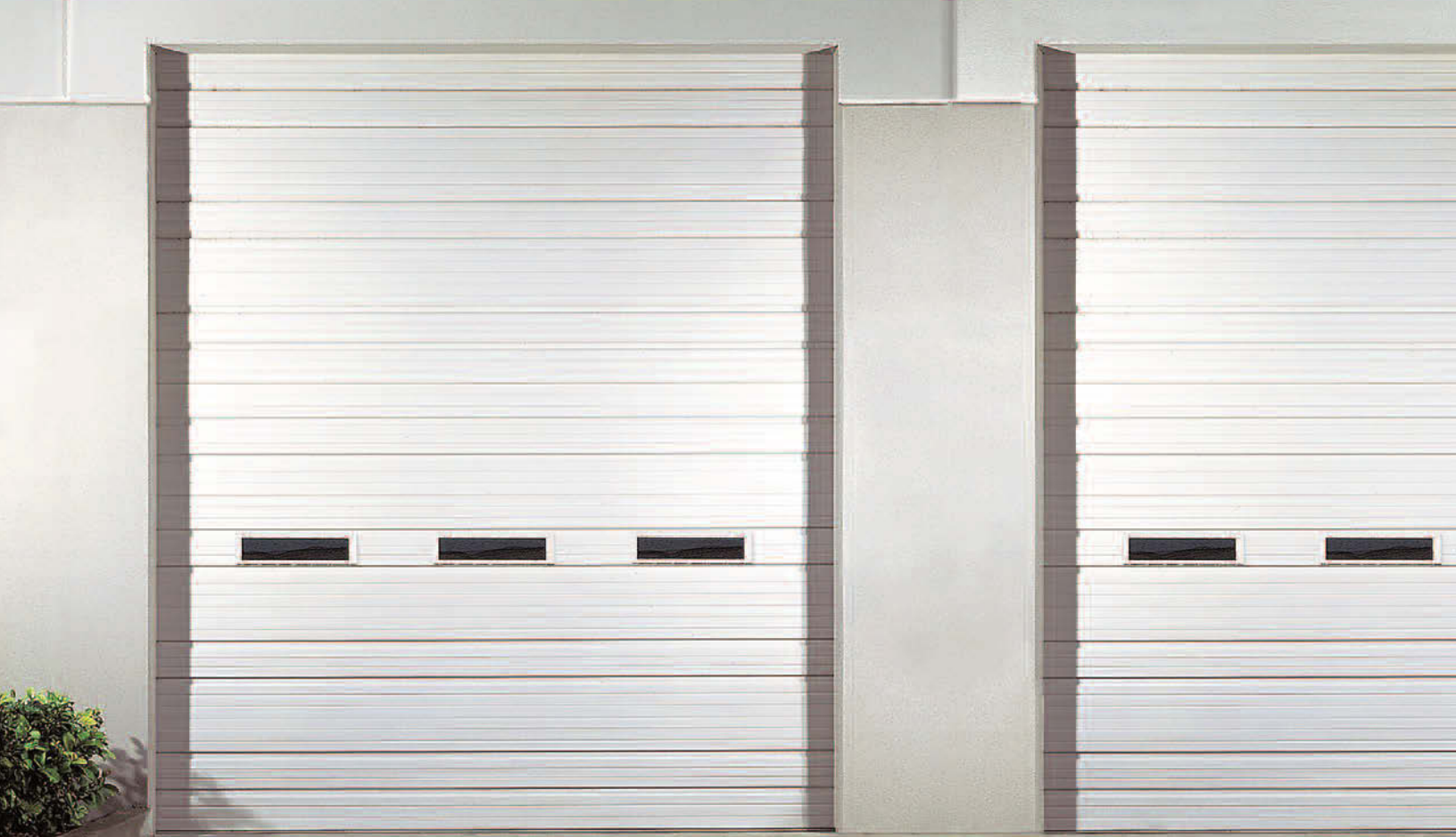
Model 524 with 24" x 6" Lites