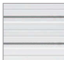
Ribbed Panel Design