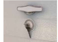
Outside keyed lock