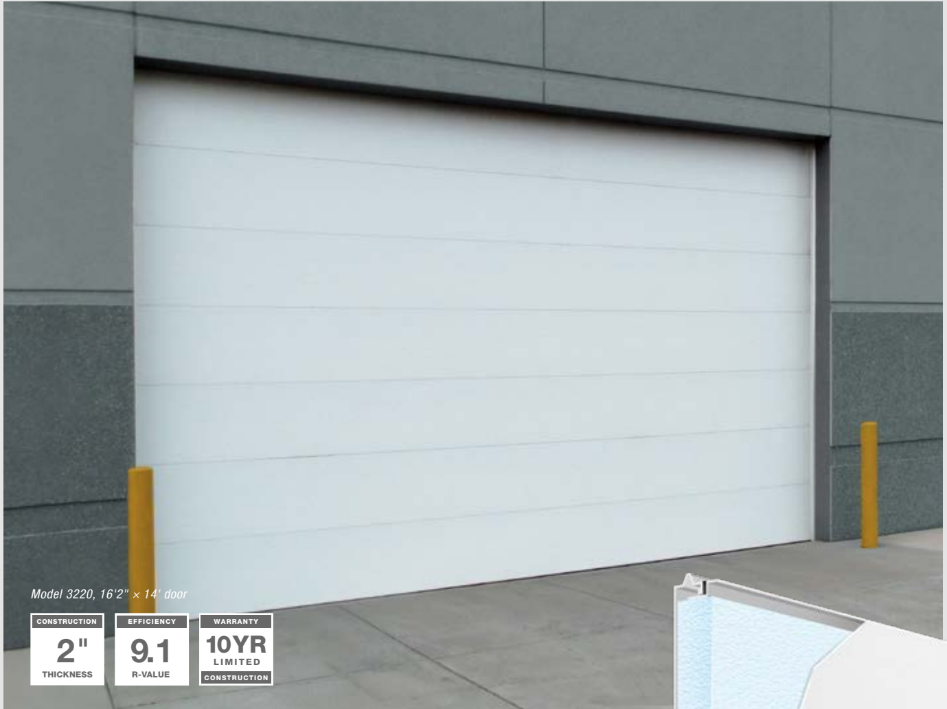
Model 3220, 16'2" x 14' door